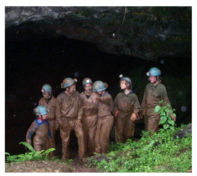
Outside Pridhamsleigh Cavern

Thanks to all the Leaders and helpers – a fantastic team – and a great camp. Camp Diary and photos by various members of the Team.