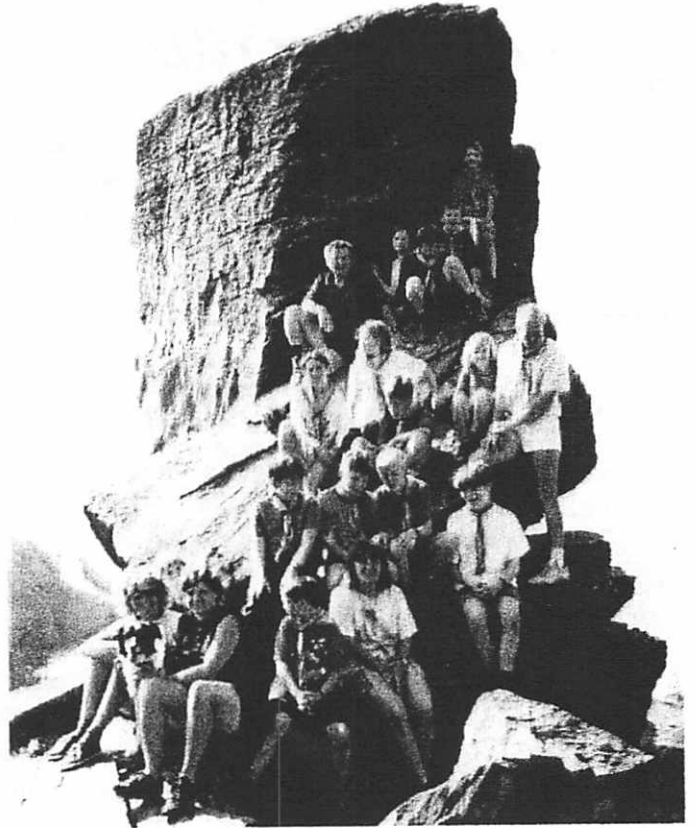
The Scouts in The Valley of the Rocks, during summer camp in Devon last year -summer camps are just some of the many things to look forward to in 1996.