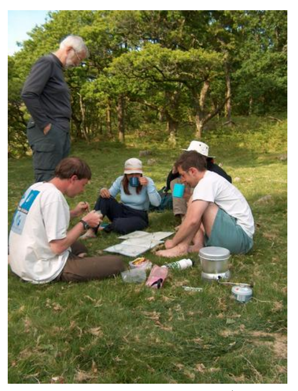
Our assessor checks our plans (and our washing up)