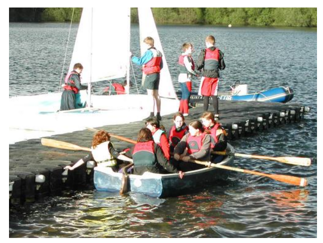
Scouts at Spinnaker on a Thursday evening