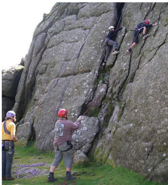
Climbing at Haytor during Camp