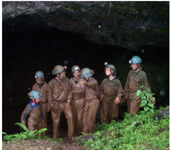
Outside Pridhamsleigh Cavern

Thanks to all the Leaders and helpers – a fantastic team – and a great camp. Camp Diary and photos by various members of the Team.