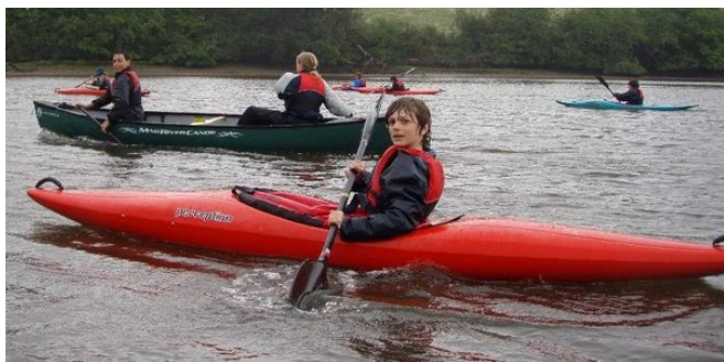
Canoeing on the Dart