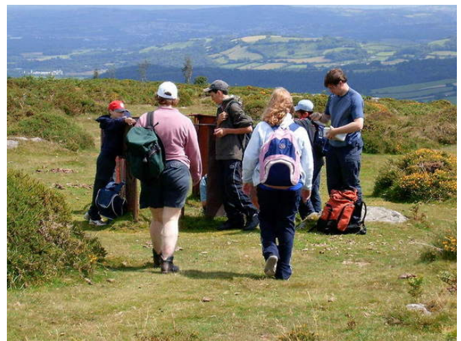
Setting out on a letter-boxing walk