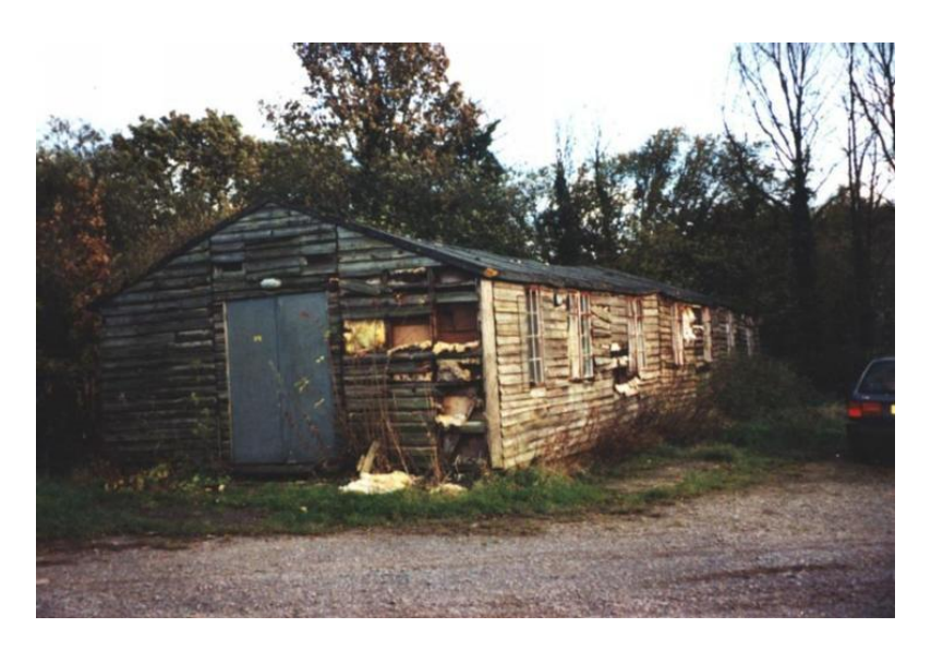
The old H.Q. - abandoned at the end of last year

Full details of the grant and what it covers will be available at the AGM on Monday 14th June (St. Aldhelms Church at 7:30pm).