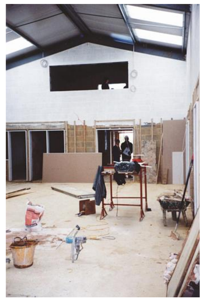
The main hall in the new H.Q. (looking South)

Our new headquarters, "Sandleheath Scout Center", is well on it's way to complete ion in early June. South Coast Construction have told us they are on target to complete the works and the building is looking fantastic. The building will be officially opened on Saturday 6th July at 6:30pm. All are welcome. There will be a Hog Roast and Barbecue.