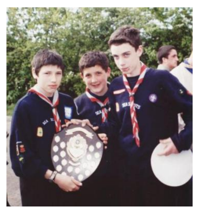
Sandleheath Scouts with the Pat Cross Trophy