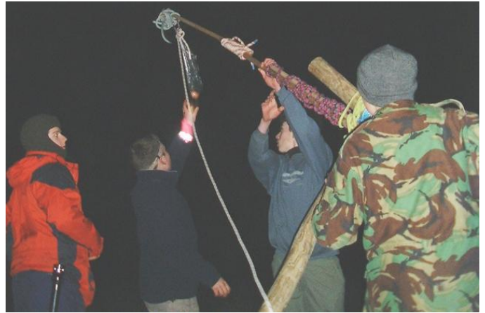
An incident base on the S.A.L.L.I.E. night hike