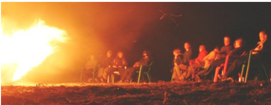
Left: Camp fire on a Scout weekend camp [I'm sorry, that's not your boat we're burning ... is it?]