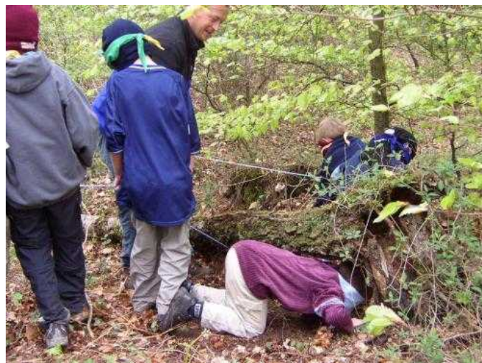
Well it's either a blindfold trail or a cub that's lost his glasses

We have just come back from a District Cub Camp. It was really good to see so many Cubs from different areas of the District coming together to enjoy a really exciting weekend. There were many exhilarating activities on camp including climbing, tracking, fire lighting, bivouacking, orienteering and blindfold trail. There were a total of 87 Cubs of which 19 were from Sandleheath. Not much