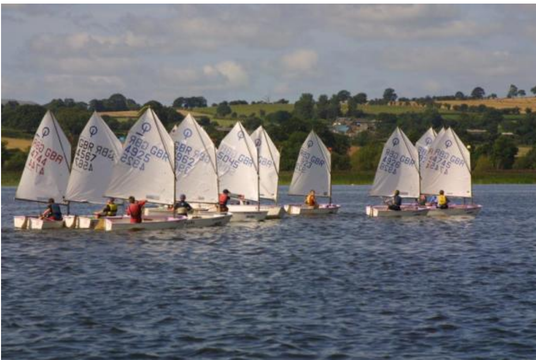
Left: Some of our Explorers compete with the best in the country