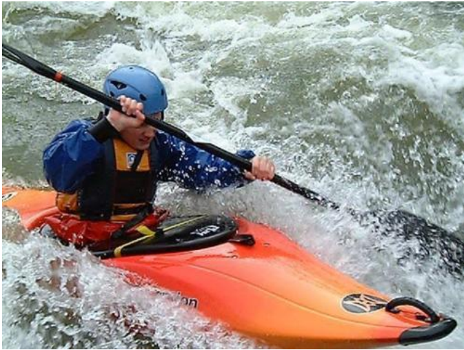
White water canoeing practice at Spetisbury prior to the Frome trip