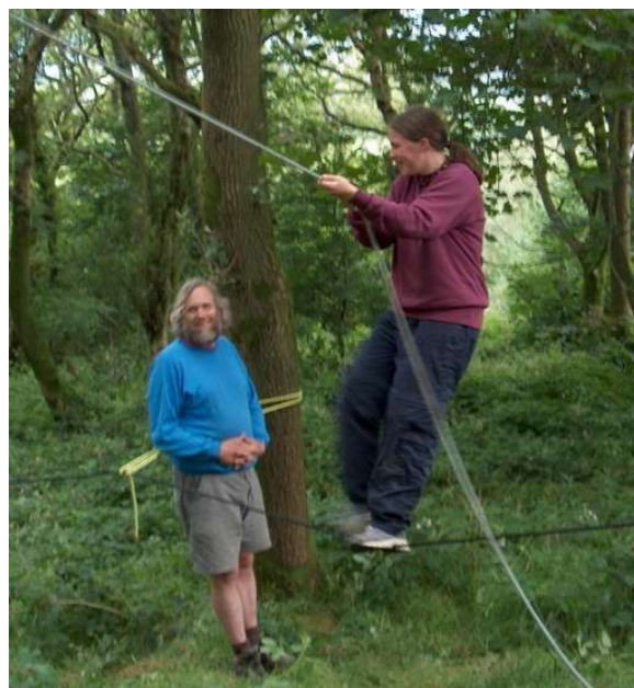
There was fun to be had on camp, despite the wind and rain