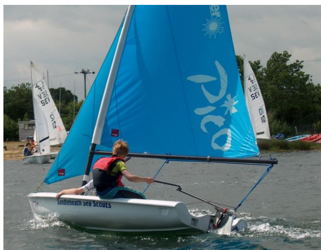
Sailing at last year's Group regatta