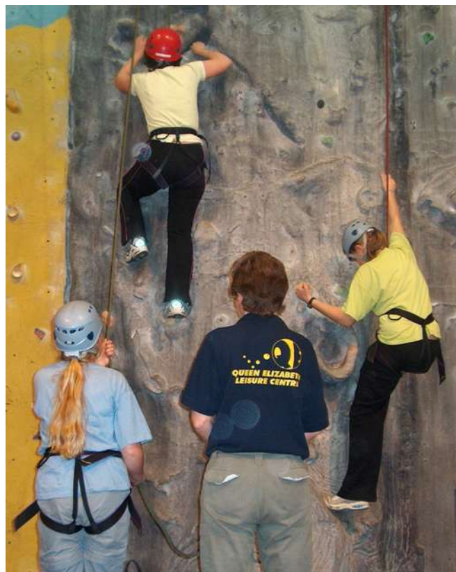
Scouts climbing at Q.E. Leisure Centre