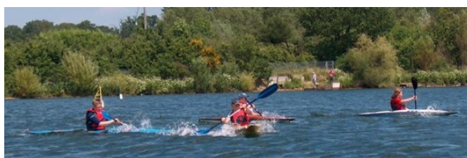
Kayaking at last year's Group regatta